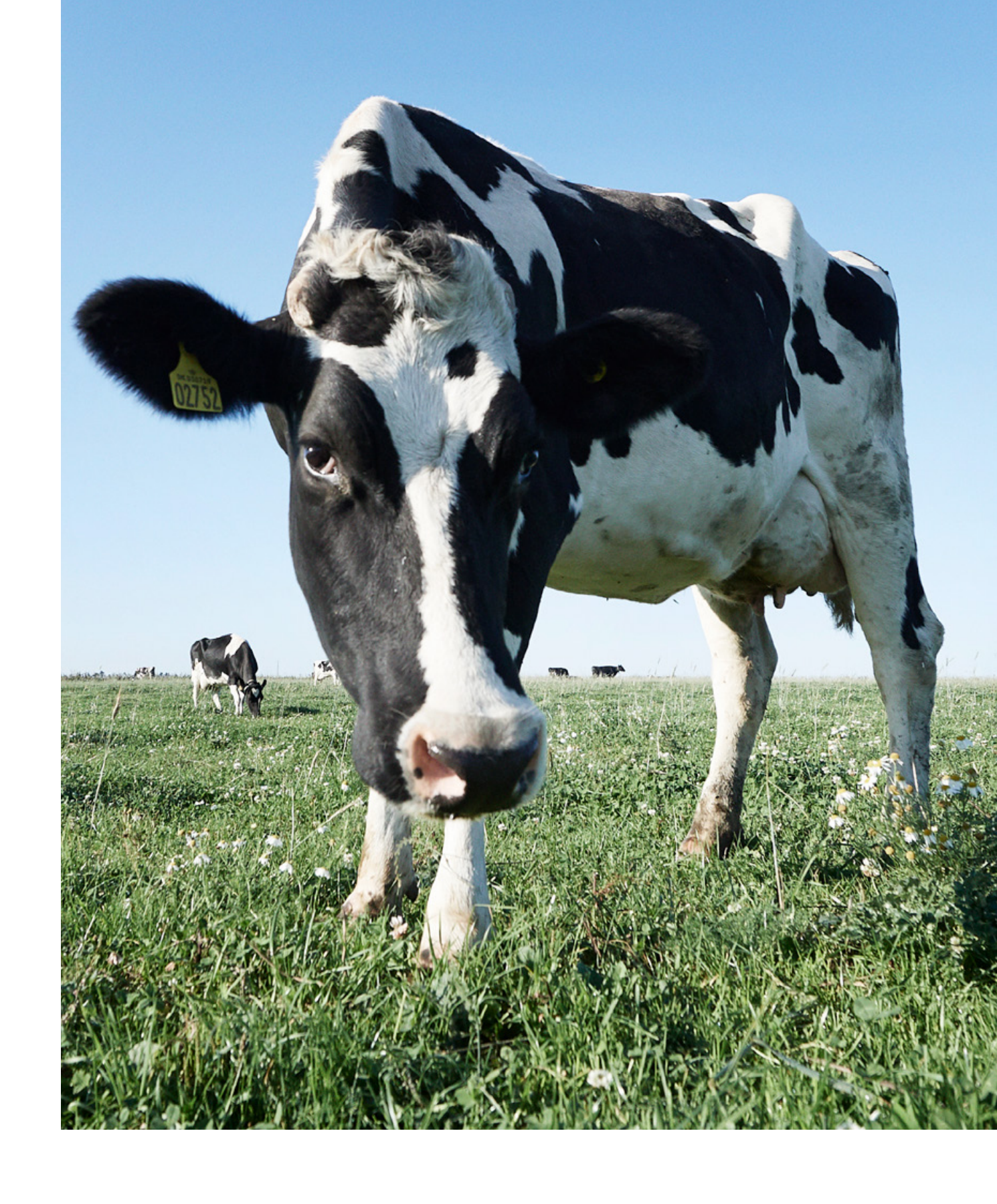
SAVE MONEY, SAVE TIME, IMPROVE YOUR PROFIT With the RDS FUTURELINE ELITE you only have a few maintenance tasks and that keeps the cost of ownership low. The solution is optimized for low energy and water consumption.

You not only get the benefit from a high yield – due to the efficient milking – you get more time on your hands and you also achieve cost-savings. You will quickly see a return on your investment.